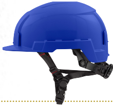
» Front Brim Safety Helmet