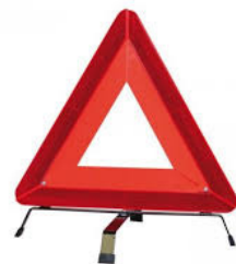
» Hazard Triangle