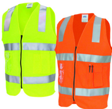
» Safety Vest with Zipper