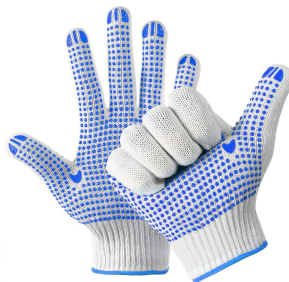
» Knitted Gloves with Dot