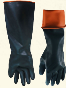
» Rubber Gloves