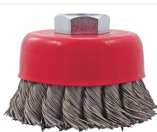
» Twist Knot Wire Brush