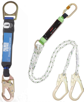
» Safety Harness with Lanyard