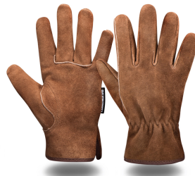
» Working Gloves Leather