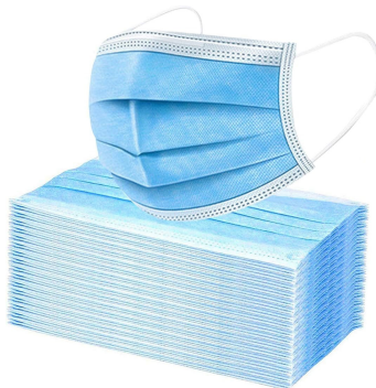
» Disposable Mask