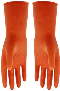
» Chemical Gloves