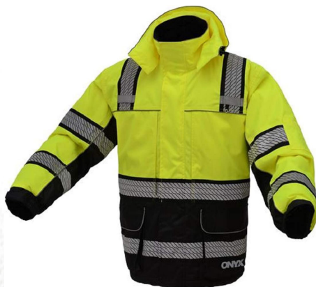
» Winter Jacket with Reflective Tape