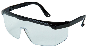
» Standard Goggle