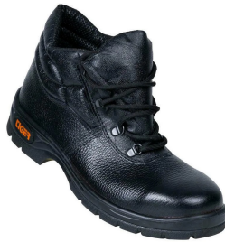
» High Ankle Safety Shoes Double Density