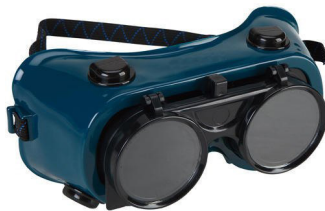
» Welding Goggle