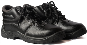
» High Ankle Safety Shoes