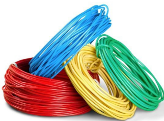
» Fire Performance cable