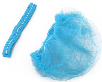
» Nursing Cap