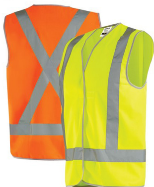
» Normal Safety Vest