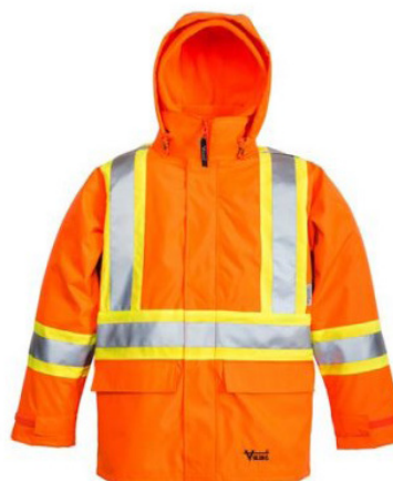
» Winter Jacket with Reflective Tape