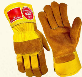
» Tig Welding Gloves