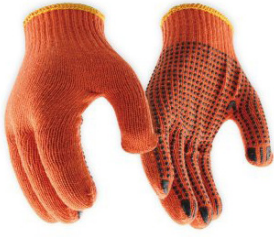
» PVC Dotted Gloves