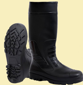
» Steel Toe Boot Safety Shoes