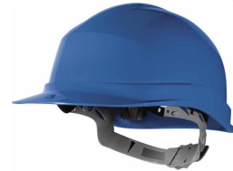
» Vented safety Helmet