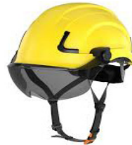
» Visor Helmet