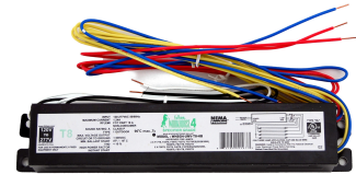
» Electrical Ballast