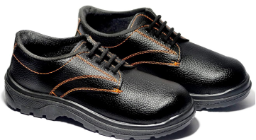
» Low Ankle Safety Shoes