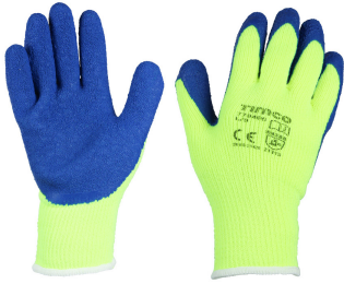
» Latex Coated Gloves Crinkle