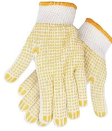
» PVC Dotted Gloves