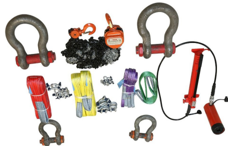
» Lifting Rigging Equipment