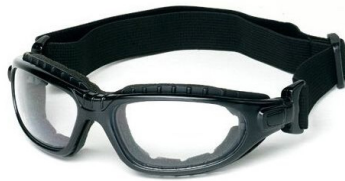
» Sand Blasting Safety Goggle