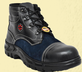
» Steel Toe Safety Shoes