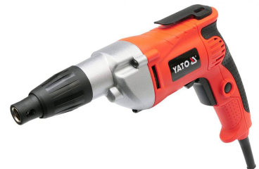
» Drywall Screwdriver