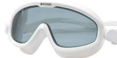
» Swimming Safety Goggle