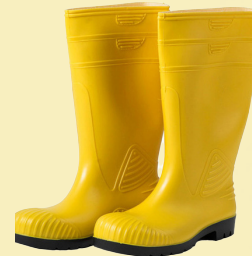
» PVC boot Safety Shoes