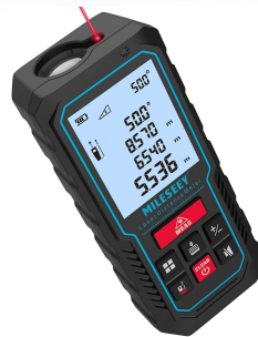
» Laser Measuring Device