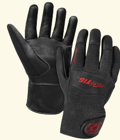
» Tig Welding Gloves