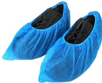
» Non Woven Shoe Cover