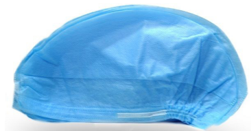
» Surgical Cap