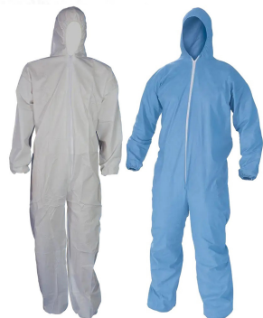
» Disposable Coverall