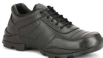
» Light Weight Low Ankle Safety Shoes