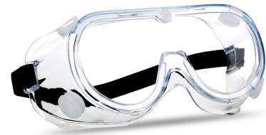
» Safety Protection Eye Clear Goggle