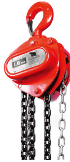
» Chain Block