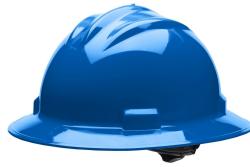
» Full Brim Helmet