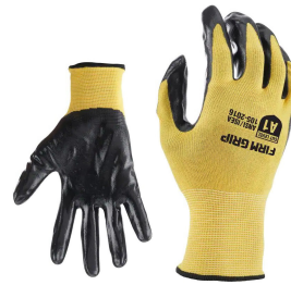
» Nitrile Coated Gloves