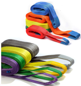
» Webbing Lifting Belt Sling