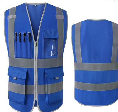
» Safety Vest with Pocket & Zipper