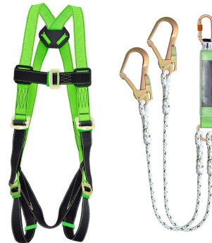
» Safety Harness with Lanyard