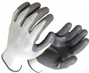
» Nitrile Coated Gloves