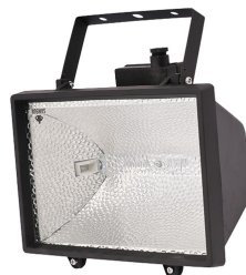
» Flood Light Halogen