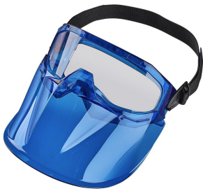
» Face Shield Goggles