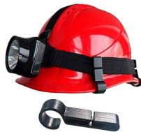
» Helmet with Head Lamp