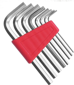
» L Key Allen Wrench Set