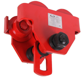
» Plain trolley 3 ton