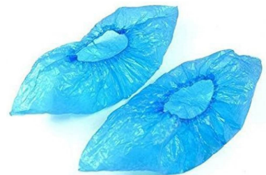
» Disposable Plastic Shoe Cover