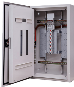
» Switch Board Apparatus