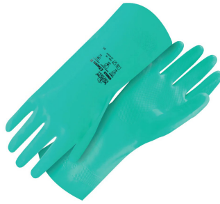
» Chemical Gloves