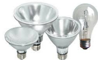
» Halogen Light Fittings