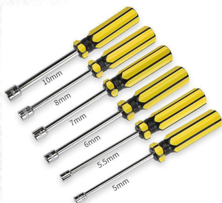
» Hex Nut Screwdrivers