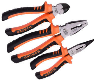
» Cutting Pliers