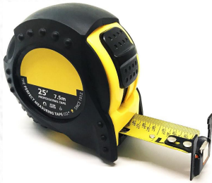
» Measuring Tape