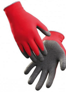
» Latex Coated Gloves Crinkle