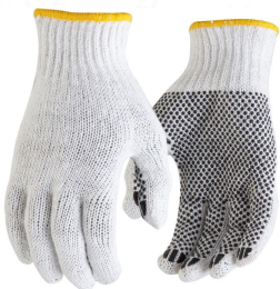
» Knitted Gloves with Dot