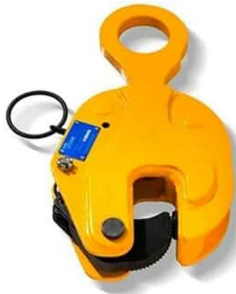
» Alloy Steel 2 Ton Plate Lifting Clamp Vertical