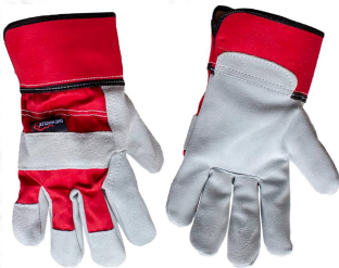
» Working Gloves Leather