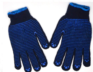
» Knitted Gloves with Dot